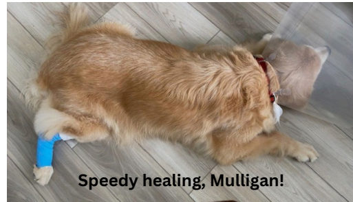
Speedy healing, Mulligan!